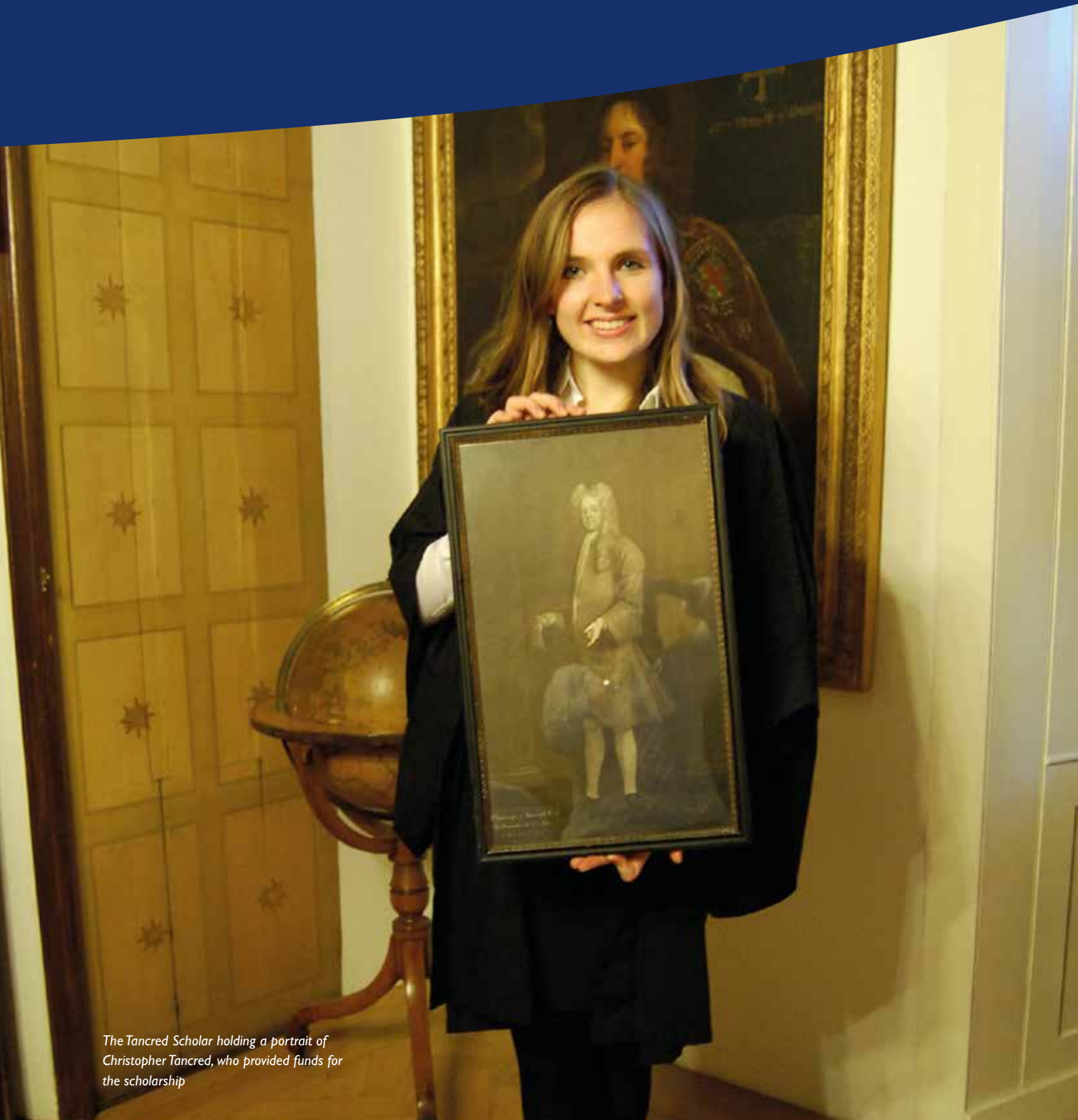
The Tancred Scholar holding a portrait of Christopher Tancred, who provided funds for the scholarship